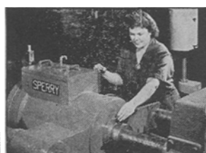
Woman operator making simple adjustments on the New Sperry EHC

The New Sperry EHC Closing Device requires only simple adjustment at two points. So easily operated that a girl can do the work that with a manual closing device required up to three men.